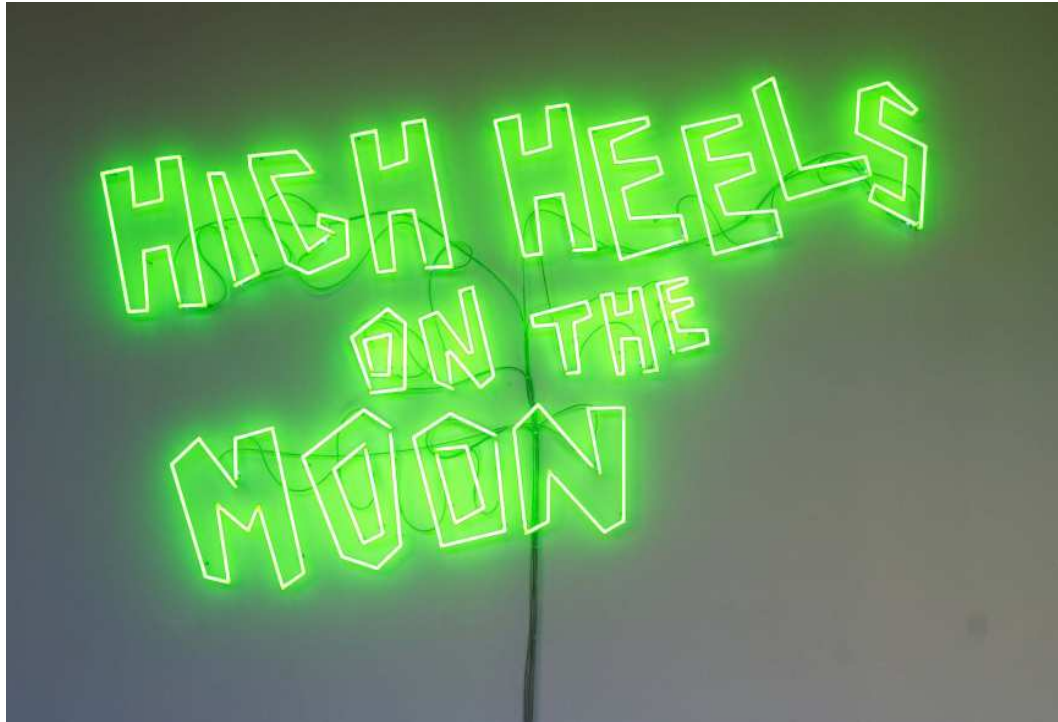
Sylvie Fleury, High Heels on the Moon, 2005