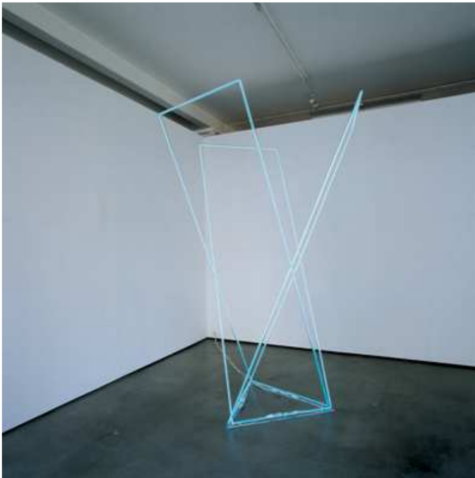
François Morellet, Neon in space, 1969/96