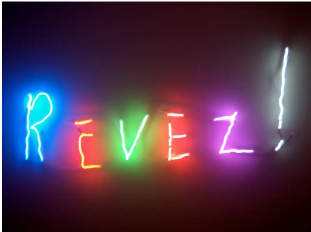
Claude Lévêque, Dream! , 2008 © ADAGP/Claude Lévêque, Courtesy the artist and Kamel Mennour, Paris