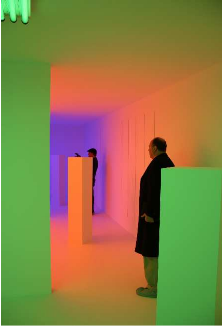
Carlos Cruz-Diez, Chromosaturation , 2011

Exposition " Carlos Cruz-Diez : Color in Space and Time ", Museum of Fine Arts, Houston (États-Unis), 2011