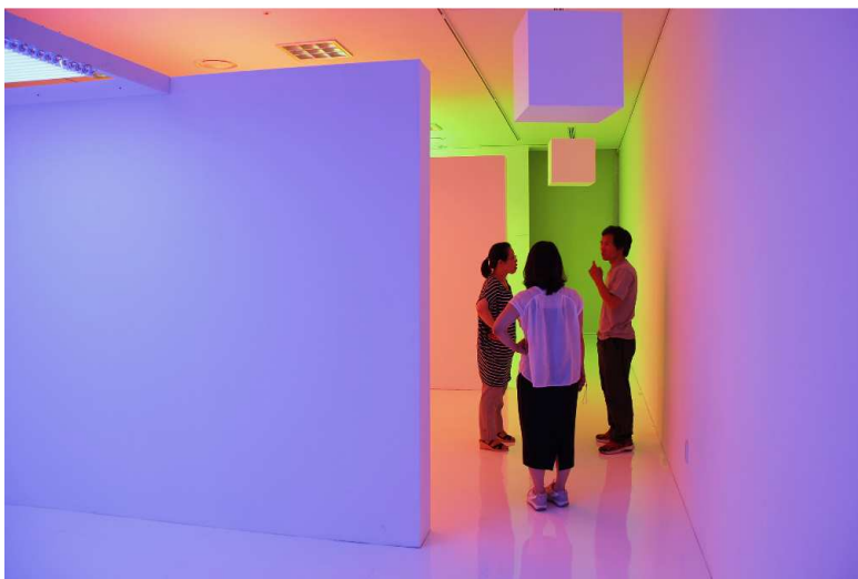
Carlos Cruz-Diez, Chromosaturation , 2011

Exposition " Cruz-Diez. Color in Space ", Dream Forest Arts Center, Sang Sang Tok Tok Gallery, Séoul (Corée du Sud), 2011