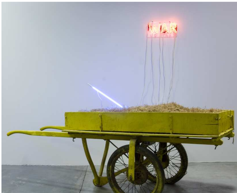
Bruce Nauman, RAW/WAR, 1970 Mario Merz, Dear Cart, 1970