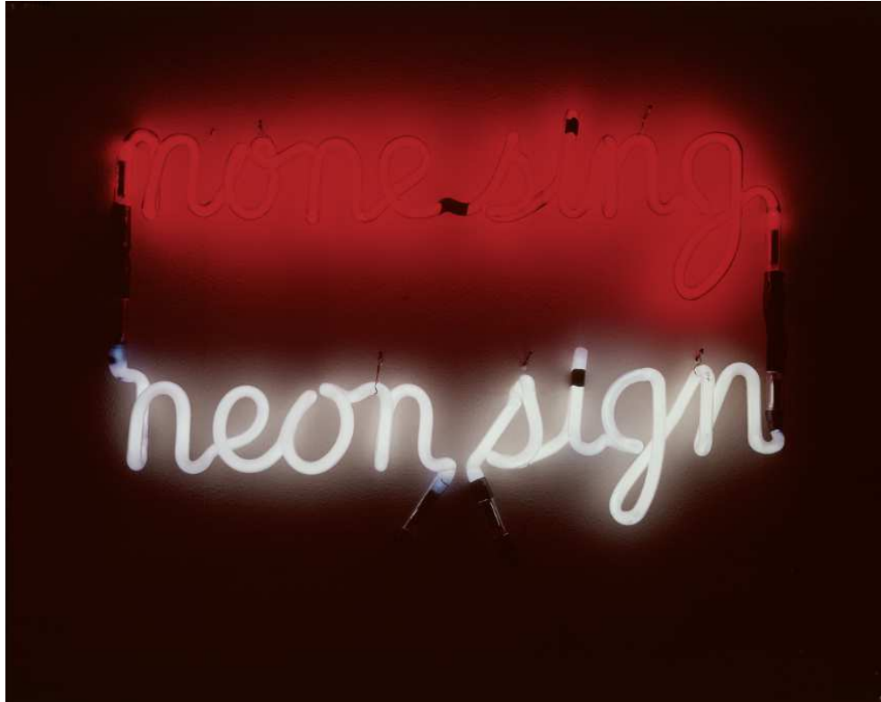
Bruce Nauman, None Sing Neon Sign , 1970 Copyright Sylvio Perlstein Collection, Anvers