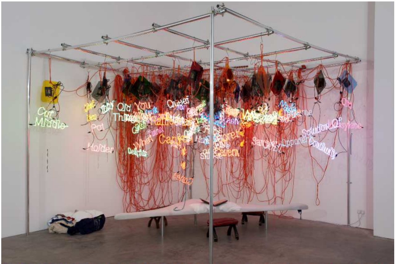
Jason Rhoades, Untitled , 2004