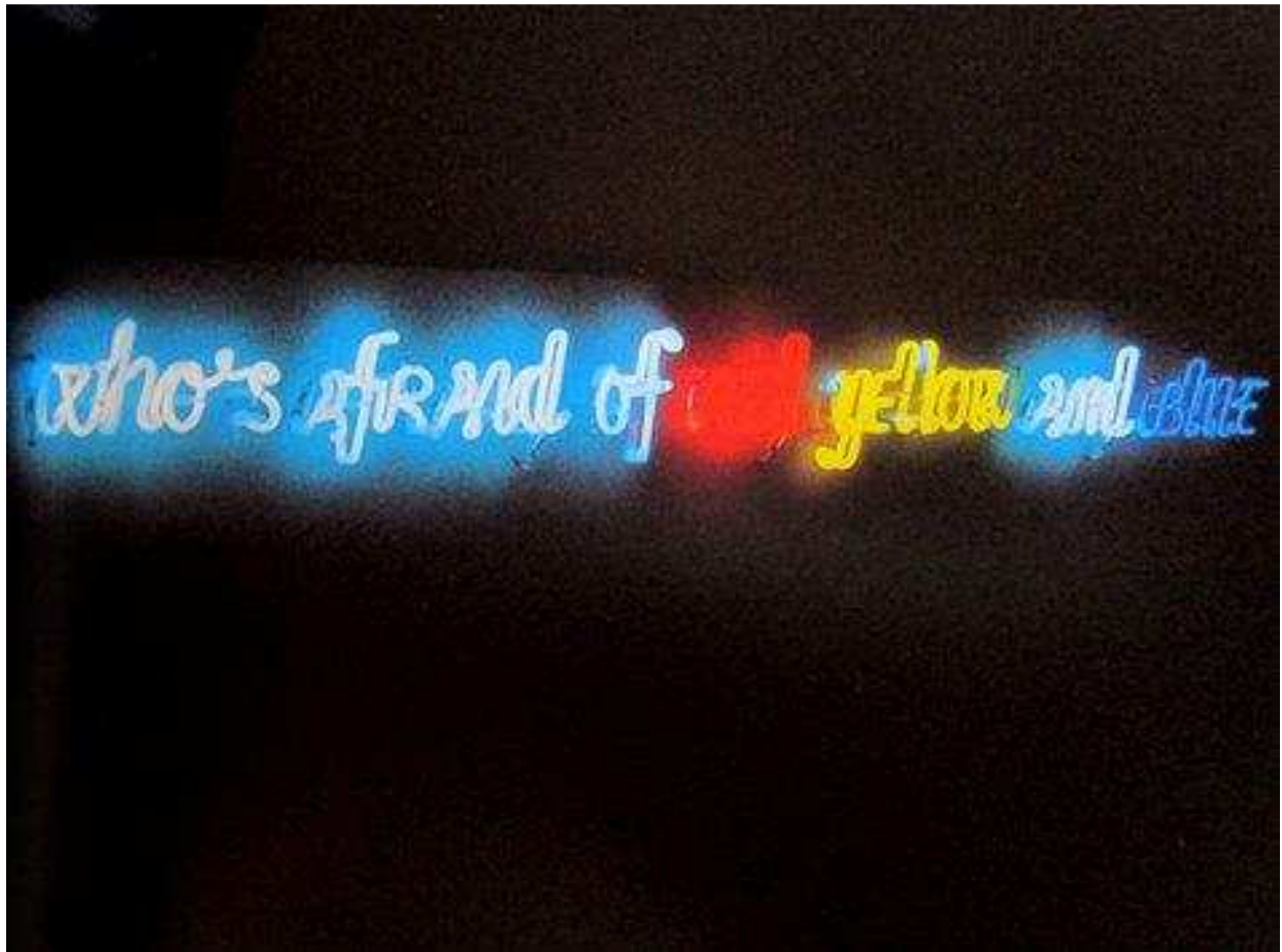
Maurizio Nannucci, Who's afraid of red yellow and blue? , 1970

private view Thursday February 16th 2012 6pm to 9pm